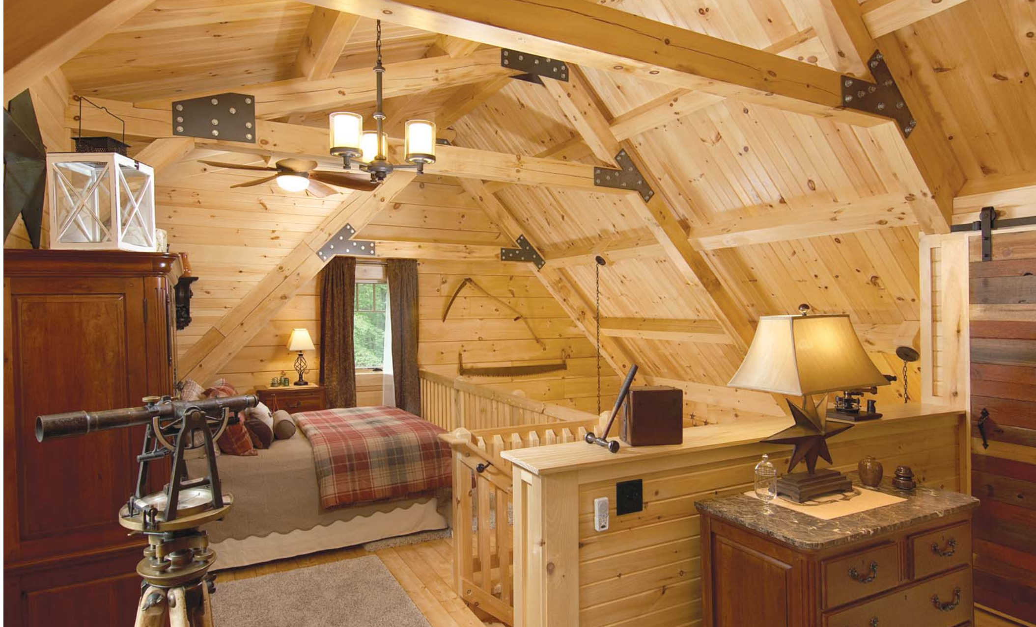
ABOVE: BEAUTIFUL ROOF BEAMS ARE VISIBLE FROM THE SECOND-FLOOR LOFT SITTING AREA AND MASTER BEDROOM, ADDING DEPTH AND A MEMORABLE ARCHITECTURAL ACCENT TO THE HOME.