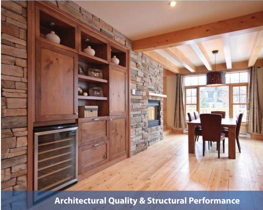
Architectural Quality & Structural Performance