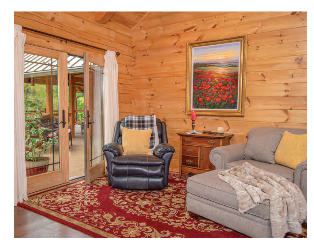
ABOVE AND RIGHT: "THE MASTER BEDROOM SUITE ISN'T JUST FUNCTIONAL," JEFF SAYS, "IT IS ALSO A REFUGE WITH A RELAXING VIEW OUT INTO THE WOODS AND MEADOW."

BELOW: A CUSTOM CIRCULAR STAINED-GLASS WINDOW PROVIDES A POP OF COLOR IN THE MASTER BATHROOM.